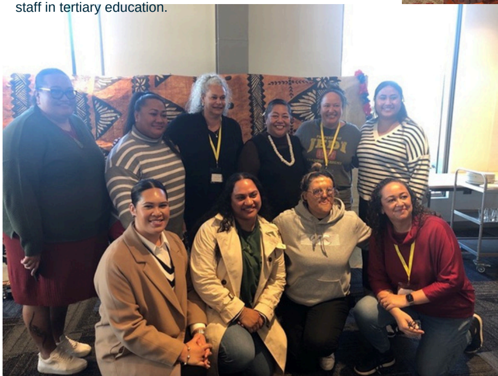
Unitec and MIT staff together at the conference