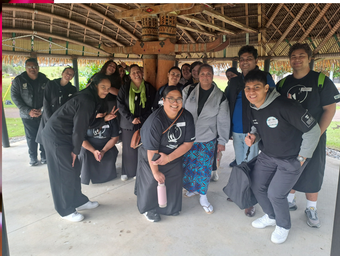
Unitec and UoA staff in the Fale

It is hoped that our team will have an opportunity to visit UoA for PD soon.