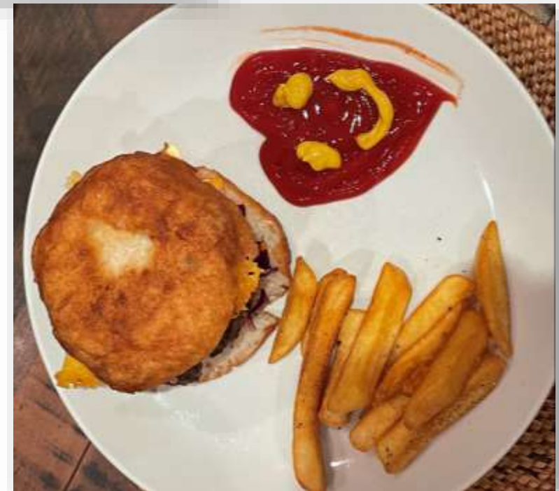
Vaughan Whaanau — Taniwhaa burgers